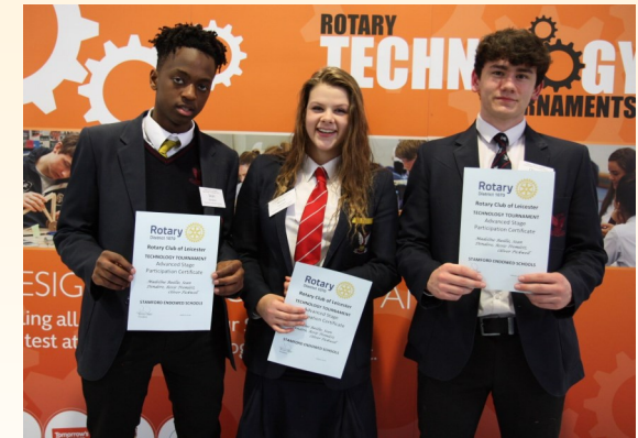
Winning Team (Advanced) — Stamford Endowed Schools

“I thought the day was a great success—the best yet. Thank you for organising it and I hope it will continue for many years to come. The Headmaster and Deputy were very impressed and you have their full backing for the event to continue at Leicester Grammar School”